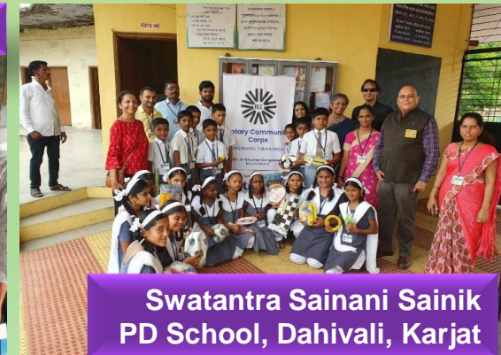
Swatantra Sainani Sainik PD School, Dahivali, Karjat