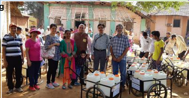
Donation Water Carts @ Lakudpada, Murbad