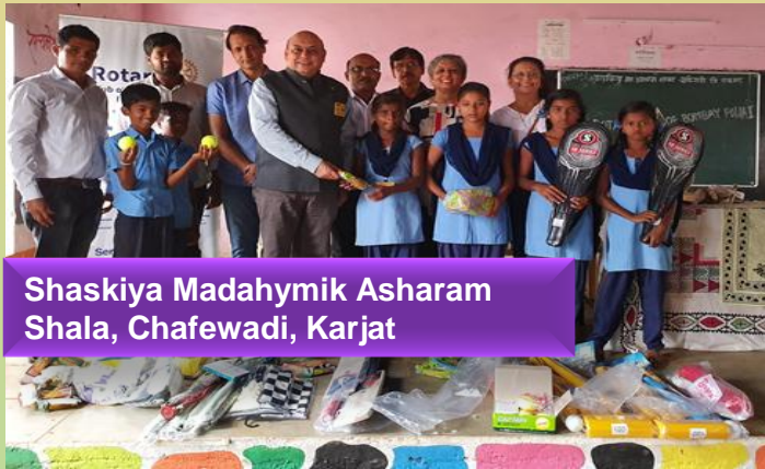
Shaskiya Madahymik Asharam Shala, Chafewadi, Karjat

We were very proud of our Happy Schools projects undertaken in the Rotary Miracle Year 2018-19, with the help of our benevolent CSR Partner in Service Antylia Scientific (formerly Cole-Parmer India Pvt. Ltd.) for tribal students in Z P Schools of Karjat, Palghar and Mumbai. We also delivered a high impact Water Provisioning project for tribals staying in Murbad taluka, Thane district.