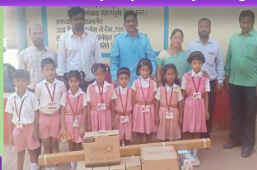
Milind Vidhyalaya, Aarey Village