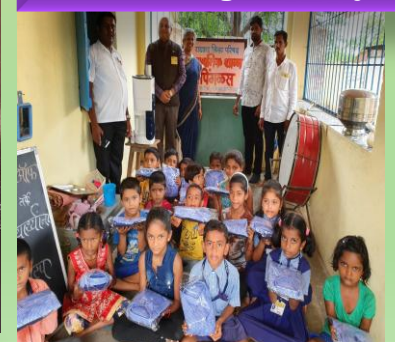
Zilla Parishad School Pinglus, Karjat