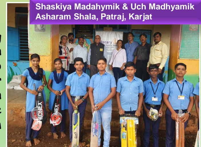
Shaskiya Madahymik & Uch Madhyamik Asharam Shala, Patraj, Karjat

14 needy schools were benefited by the Happy School projects implemented, making a positive impact to 10000 students, coming from poor tribal families or urban poor/ultra poor families. A small portion of the funds were used to undertake two Water Projects : First one to benefit all households in one village to get one water cart each (with water drums), reducing the daily pain & drudgery of women in fetching water carrying heavy vessels on head; In the second project a water pipe scheme was created for a village on a hillock, sourcing water from the downstream river, getting water to about 100 families.